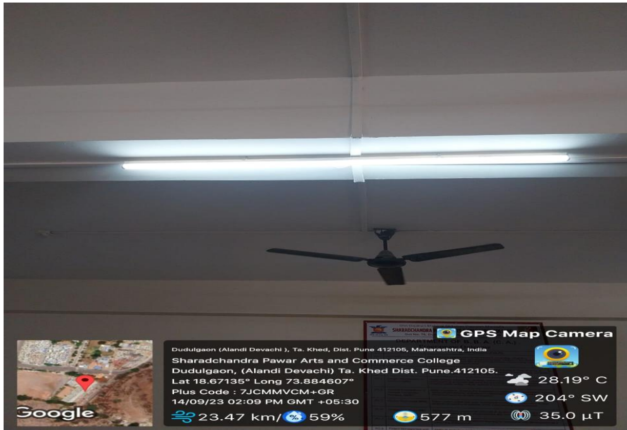
Use of LED Tube

7.1.2. - The Institution has facilities for alternate sources of energy and energy conservation measures Solar energy Biogas plant Wheeling to the Grid Sensor-based energy conservation Use of LED bulbs/ power efficient equipment during the Year 2022-23